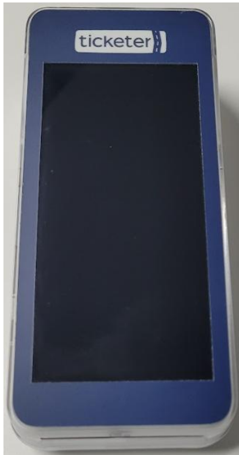
Image of Ticketer Handheld 2.0

Certificate Number C00213-1 (P2) Ticketer Handheld 2.0